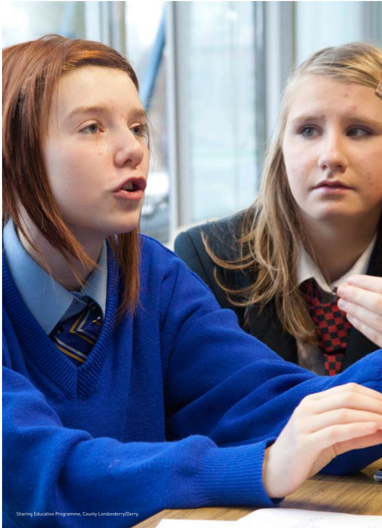
Sharing Education Programme, County Londonderry/Derry.